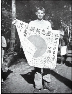
Typical young Marine with souvenir flag; c. 1944